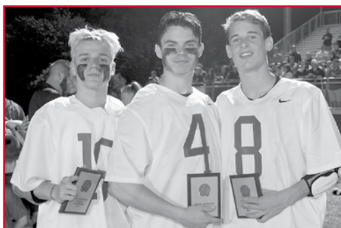
County champion boys lacrosse team.