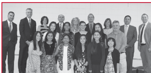
Long Island champion girls golf team.