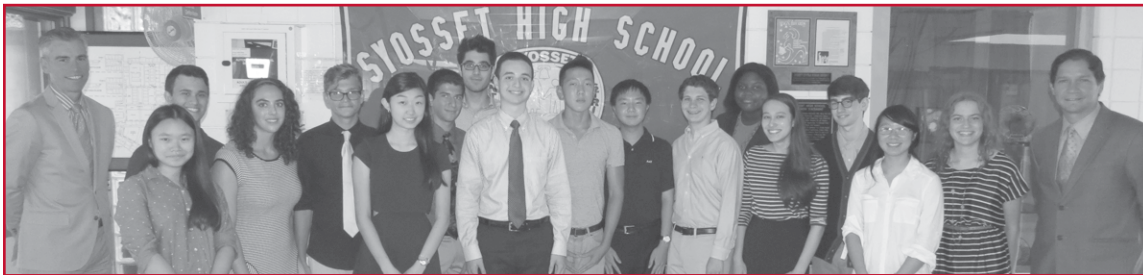
National Merit Scholarship semifinalists, finalists and Commended Students.