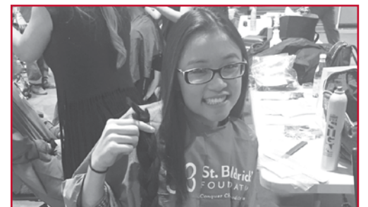
St. Baldrick's event fought childhood cancer.