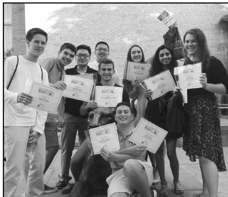
Award-winning staffers of The Pulse, Syosset High School's newspaper.