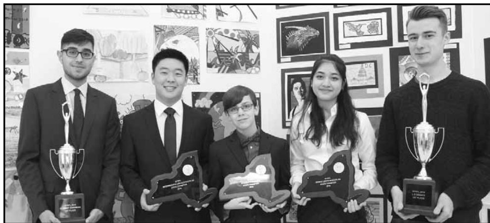
Forensics Society members displayed individual awards and the two team trophies they won at the New York State Forensic League Championship.