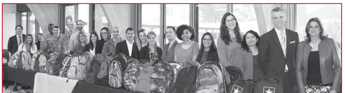
The “We CARE” drive collected 150 backpacks filled with useful items for the homeless.

Class of 2016 is comprised of hard-working achievers who achieved personal success, but also demonstrated character in helping others achieve their accomplishments throughout the 2015-2016 school year.