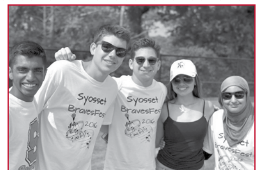
Student Government-led BravesFest raised funds to benefit clubs and music education.