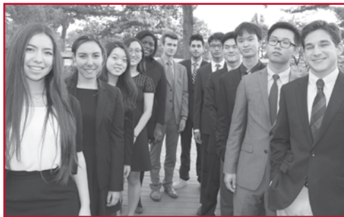
National recognition for Forensics Society.