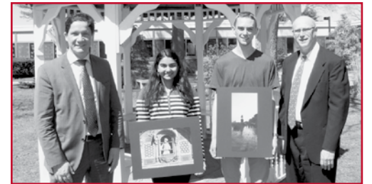
Long Island Best Artists.