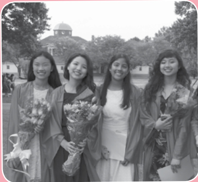
South Woods Middle School