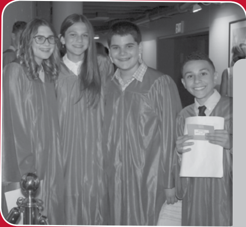
H.B. Thompson Middle School