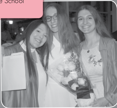
H.B. Thompson Middle School