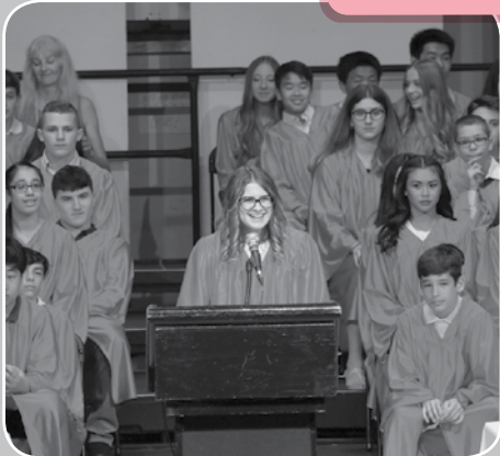
H.B. Thompson Middle School