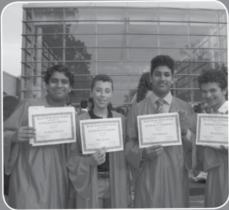
South Woods Middle School