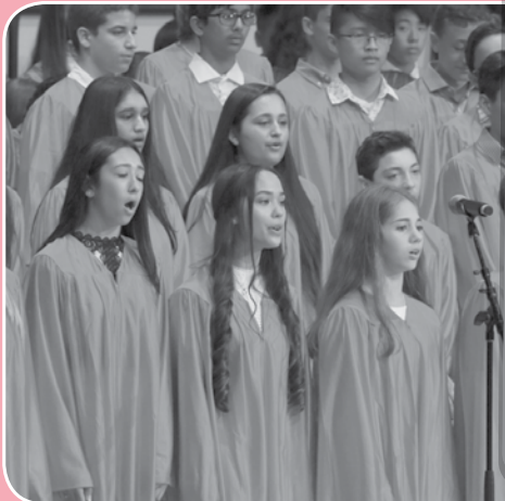
South Woods Middle School