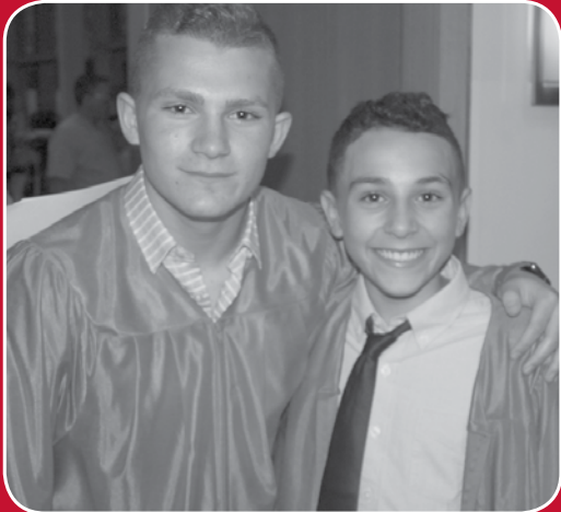
H.B. Thompson Middle School