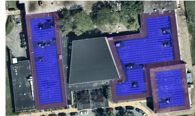
H. B. Thompson Middle School – 250.4 kW