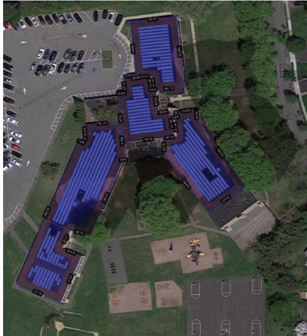
Willits Elementary School – 216.4 kW