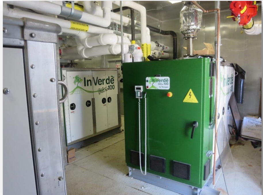
Johnson Controls Installation of 100 kW Cogeneration Unit at Eastport School District