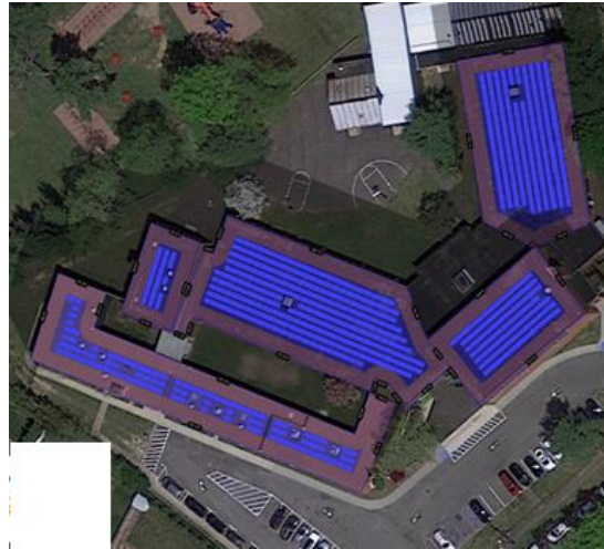
Berry Hill Elementary School – 199.7 kW