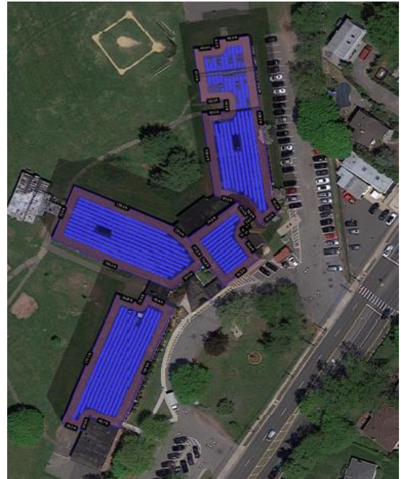
Baylis Elementary School – 282.4 kW Design